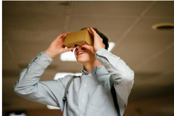
Figure 2. Using Cardboard to Experience VR

cable) connection. In general, high-end VR HMDs operate at a higher level of immersion than their low-cost competitors, which is reflected in their capacity to deliver a more immersive experience.